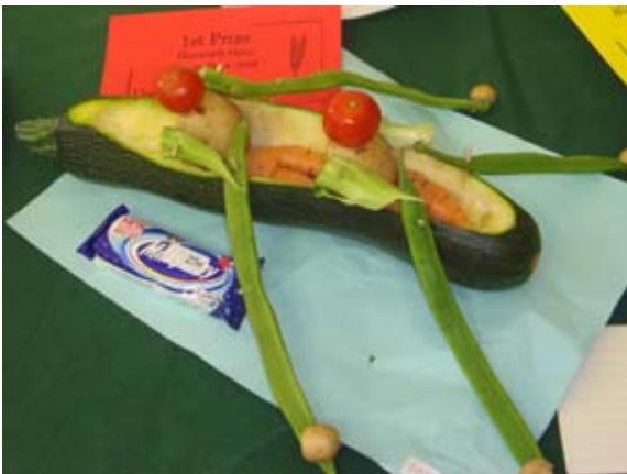
Harriet's vegetable athletes