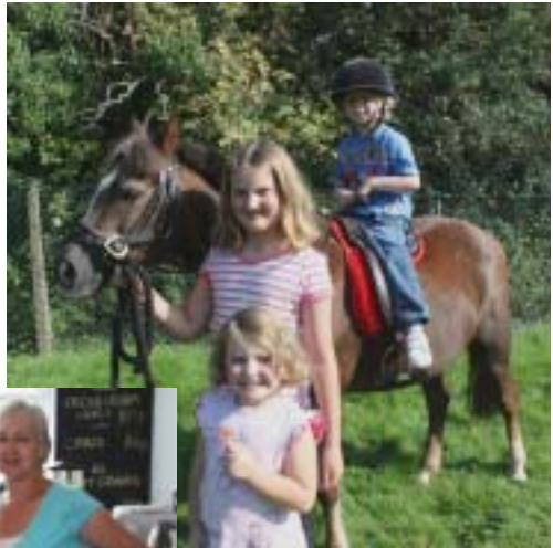
Bouncer with friends