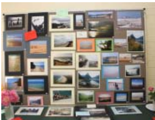
Many entries in the popular photographic classes