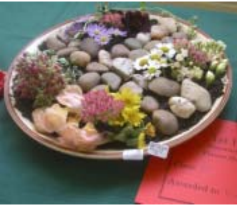
Harriet's prize winning garden on a plate