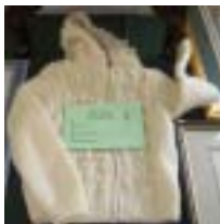
Perfect knitting from Madeleine