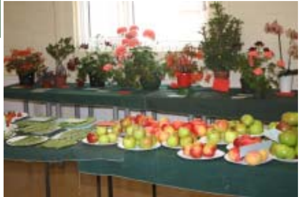
Apples and plants