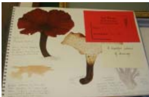
Pat Guy's stunning watercolours