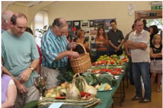
Admiring the produce