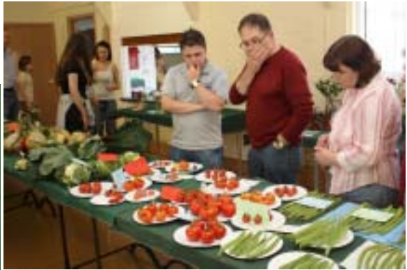
The Hurley's pondering the tomatoes