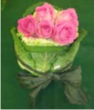
Zoe Millington's stunning 5 flowers and foliage