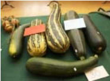
A variety of marrows