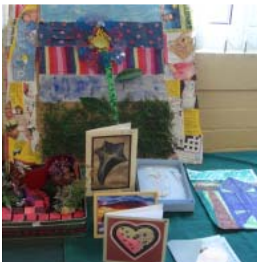
Home made greetings cards