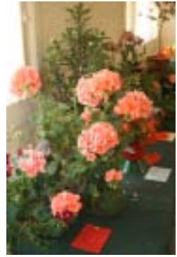
Prize winning floral exhibits